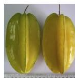
Averrhoa carambola L.